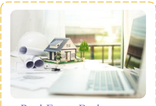
Real Estate Brokerage Hotels, Residential, Investments, Data Centres, Land, Property Search service for notable clients Cities, Alps etc.