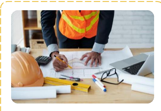
Investment advisory Real Estate & Operational Businesses