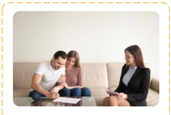
Raising Capital Connecting clients to investors, banks and crowd lending / funding, Mezzanine & equity