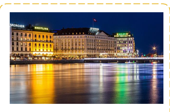
Brokerage Marmont Hotel Geneva

100 Keys 4* Operator Lease by Room Mate from M3 Hospitality <a href="https://en.marmonthotel.ch">https://en.marmonthotel.ch</a>