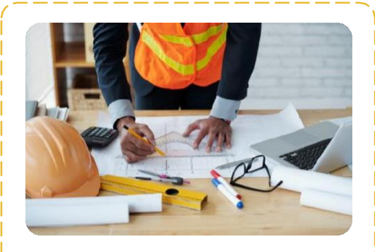
Investment advisory High net worth hotel investor